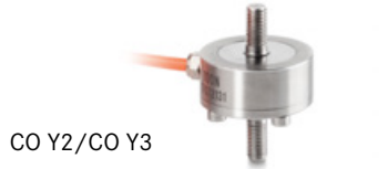
CO Y2/CO Y3