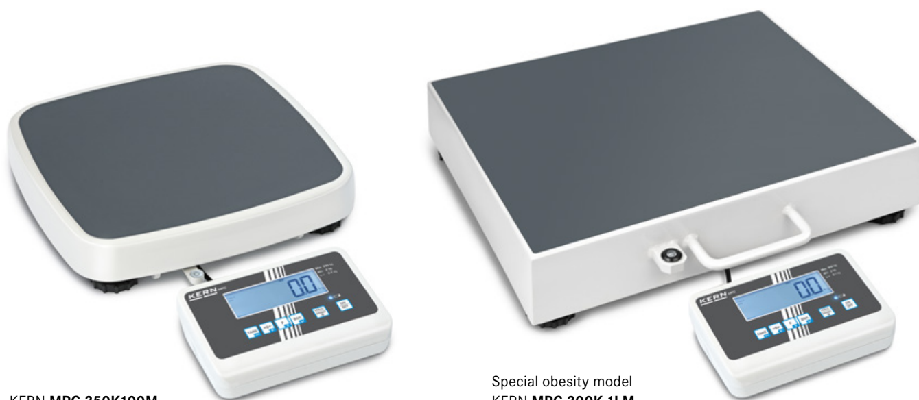
KERN MPC 250K100M

Compact personal floor scale – with EC type approval and approval for professional medical use in medical diagnostics