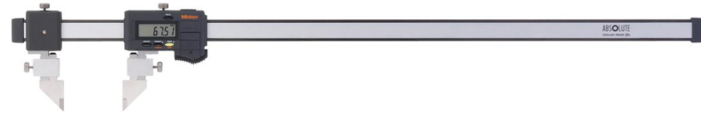
552-182-10 with optional accessories 07CZA056