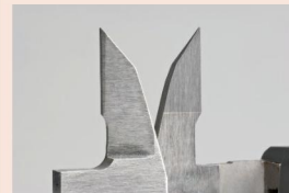
Carbide tipped jaws inside and outside 505-735