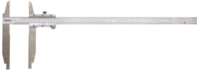
533-404 Without fine adjustment