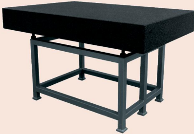
Granite plate and stand (optional)