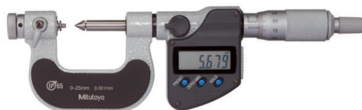
326-251-30 with optional accessories