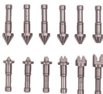
Interchangeable anvils/spindle tips in matching pairs