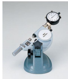
Sample application: with dial indicator