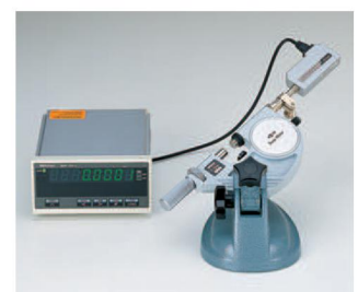
Sample application: with Linear Gauge