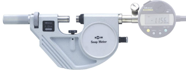
523-141 with optional indicator