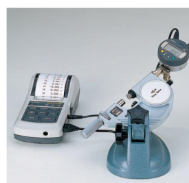
Sample application: with digital indicator